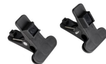
2 x Plastic Clips