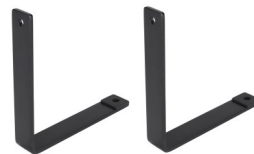
2 x L-Brackets