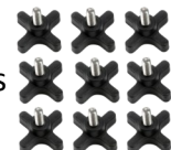
9 x Foot Thumb Screws (1/4" x 14mm)