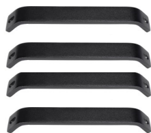
4 x Support Bars