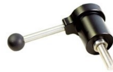
Euro Adapter Key