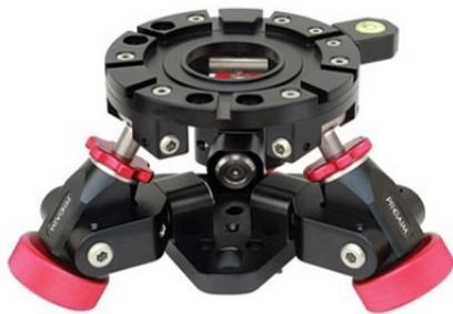
3 Way Leveller

Please inspect the contents of your shipped package to ensure you have received everything that is listed below.