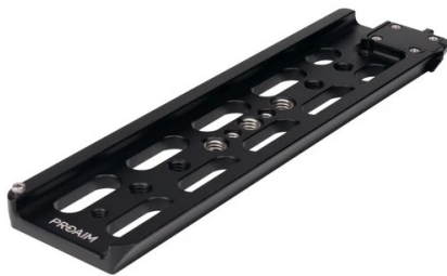
Dovetail Tripod Plate

Please inspect the contents of your shipped package to ensure you have received everything that is listed below.