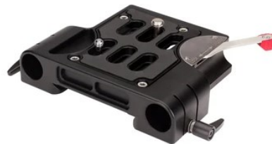
19mm Camera Base Plate