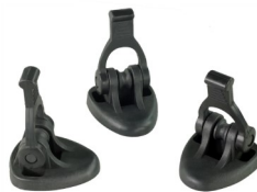
3 x Proaim Rubber Tripod Shoes