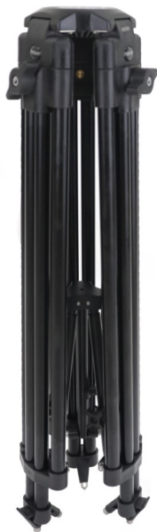
100mm bowl Tripod Stand

Please inspect the contents of your shipped package to ensure you have received everything that is listed below.