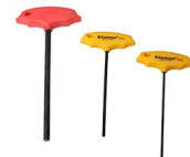
3 x T-Type Allen Key (Size : 3mm, 4mm, 5 x 16")