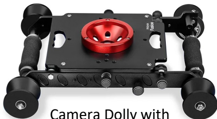
Camera Dolly with 100mm bowl

Please inspect the contents of your shipped package to ensure you have received everything that is listed below.