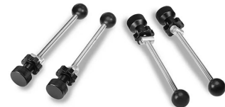
4 x Adjustable Leveling Legs