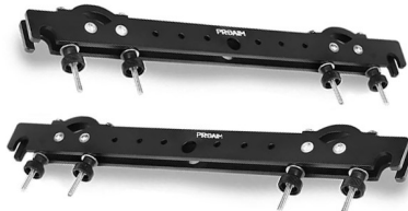
2 x End Feet