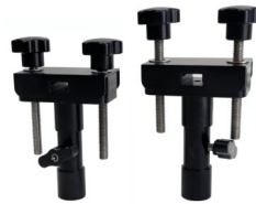
2 x Track Clamps