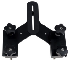
1 x Camera Mounting Plate