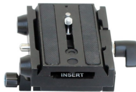
Quick release plate