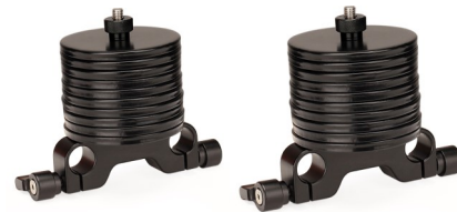
20pcs Weight Plates