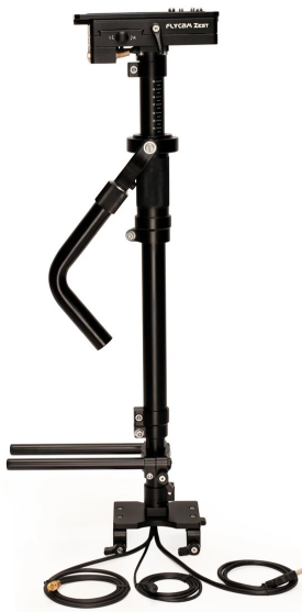
Telescopic centre post with Inbuilt Cables 2x 200mm Rods

Note: If you have purchased (ST-ZEST-PRO-02), You will receive the following.