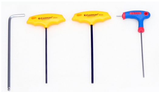
3/16mm, 4mm, 3mm, 2.5mm Allen Keys