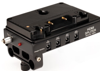
Gold Mount Battery