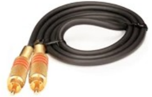
RC to RC male cable