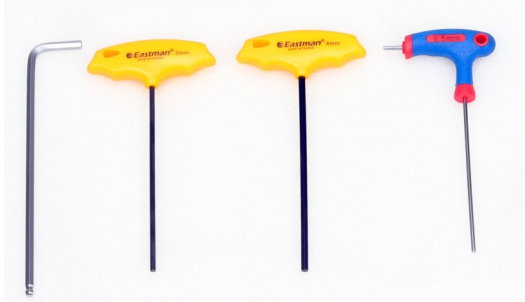
3/16mm, 4mm, 3mm, 2.5mm Allen Keys