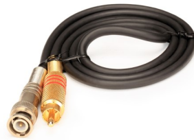
RC male to BNC male cable