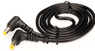
DC Power cable