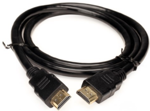
2 x HDMI male to male cable