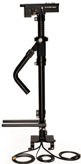
Telescopic centre post with Inbuilt Cables 2x 200mm Rods

Note: If you have purchased (ST-ZEST-PRO-01), You will receive the following.