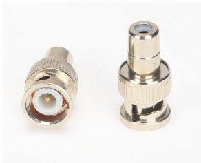
2 x RC Female to BNC male Connector