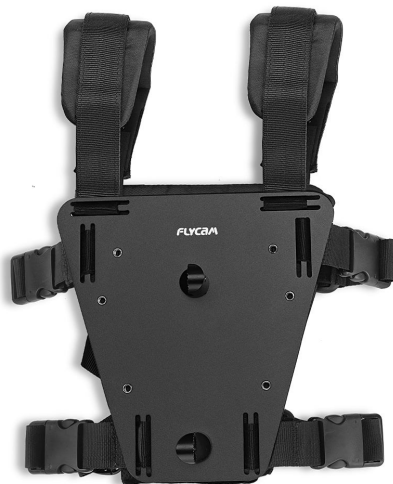
Flycam DSLR Camvest

Please inspect the contents of your shipped package to ensure you have received everything that is listed below.