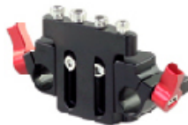
15mm Rod Adapter