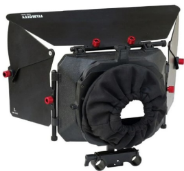
Matte box MB-600