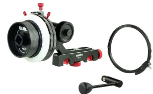
HS-2 Follow Focus