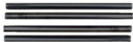
3 X 300mm Female Rods