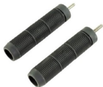
15mm Straight & Z-Brackets