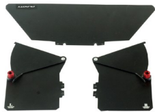
French and Side Flags