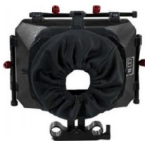
Matte Box MB-600

Please inspect the contents of your shipped package to ensure you have received everything that is listed below.