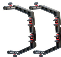
9" Cage Brackets