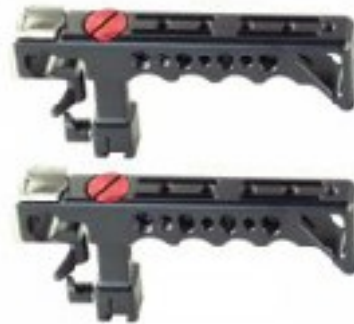
2x side Handle