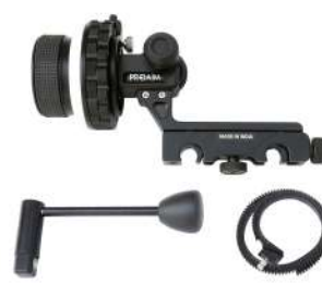
HS -1000 Follow Focus