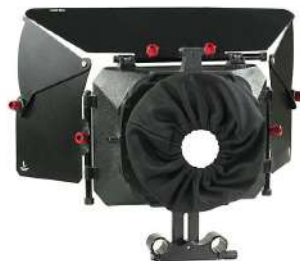
MB-600 Matte Box