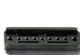
Sliding base plate