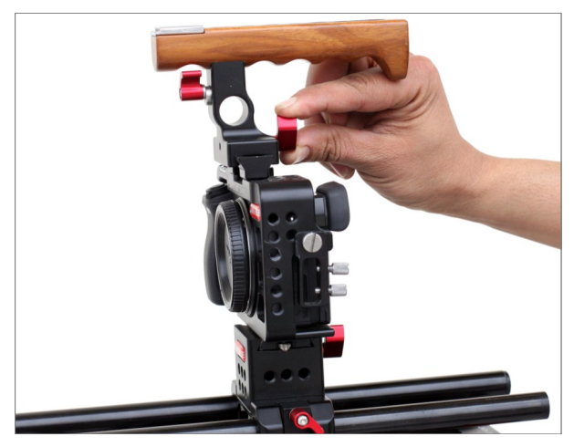
YOUR CAMTREE HUNT CAMERA CAGE WITH HANDLE & BASEPLATE ALL DRESSED UP AND GOOD TO GO