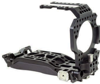
Baseplate with Cage

Please inspect the contents of your shipped package to ensure you have received everything that is listed below.