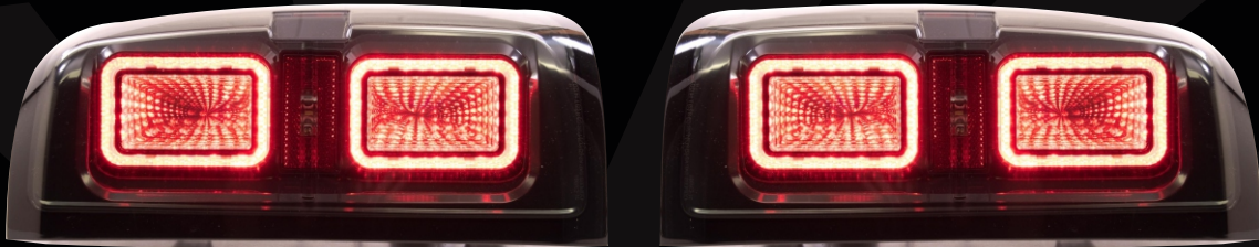
2X TAIL LIGHT ASSEMBLIES

IMPORTANT: If your vehicle is equipped with anything but OEM turn signals (full assemblies, LED bulbs, or otherwise) in the head lights or elsewhere: You may experience a hyper flash and/or problem with the sequential signal setting on these taillights. This is not a defect in the taillight, and caused by un-matched impedance with your original vehicle settings.