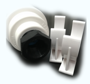
>>> THE T (322T)

This model is used for a more permanent, under-the-sink setup. It comes with a pair of 1/2" reducer bushes and a set of mounting clips, making installation easy as.