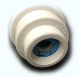
>>> THE BARE (322B)

And you don't even have to worry about getting thread tape or paste* because every filter comes with food-grade, blue washers ready to go.