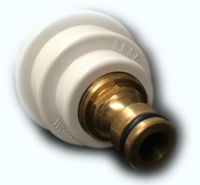
Our fittings are made with leadfree brass right here in QLD!

The brass model is chosen for durability- for those whose filters get knocked around a bit more if they're attached to the hose outside.