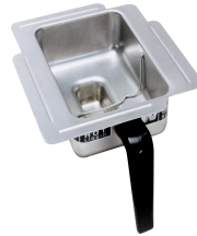
FUNNEL ASSY, SST-PP BLK HNDL