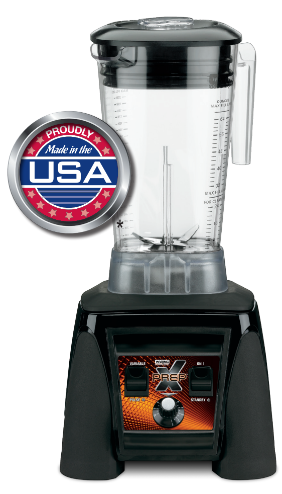
*Made in USA with US and foreign parts.