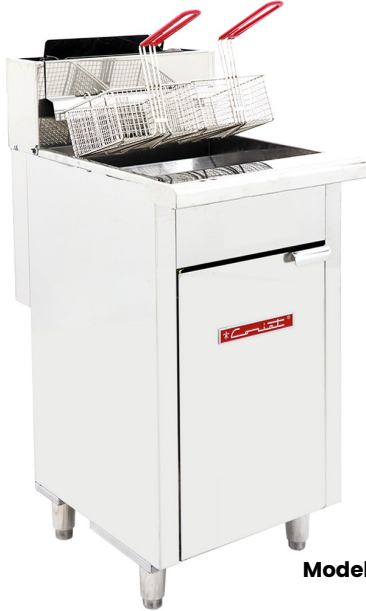
Model TURBO 30-5Q

The images presented here are illustrative and may vary or not exactly match the physical product.