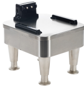
1SH STAND, 120V INF SERIES