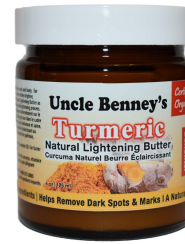
Turmeric Natural Lightening Butter - 4 oz

Benefits: Lightens skin for a more visibly, brighter, even skin tone. Revitalizes and invigorates the skin to create a healthy glow. Naturally fades the appearance of existing scars. Suitable for all skin types.