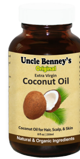
Uncle Benney's Original Extra Virgin Coconut Oil - 8 oz Pure and Natural - Nothing More

Benefits: Made with skin loving organic ingredients that soothe and moisturize rough, dry, tight, dehydrated skin. Excellent for mature and sensitive skin.