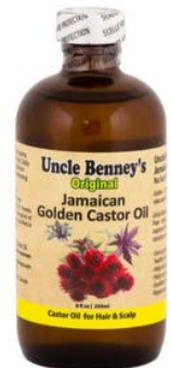
Uncle Benney's Original Jamaican Golden Castor Oil - 8 oz No Salt, Natural, Raw

For Hair: Softens and add shine to dry, dull and brittle hair, Helps control dandruff, flaking and itchy scalp.