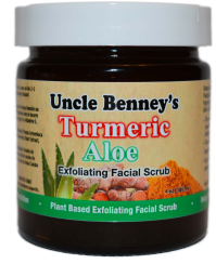
Turmeric Aloe Exfoliating Face Scrub - 4 oz

Benefits: Lightens skin for a more visibly, brighter, even skin tone. Revitalizes and invigorates the skin to create a healthy glow. Naturally fades the appearance of existing scars. Suitable for all skin types.