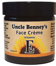
Vitamin E Face Crème - 2 oz

Benefits: Highly effective in reducing stretch marks. Moisturizes and soothes eczema, dry, itchy and dam-aged skin. Tones uneven skin, mini-mize the appearance of existing scars and wrinkles. Suitable for all skin types.