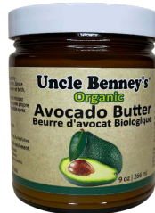
Organic Avocado Butter - 9 oz

Use to help control severe facial hyperpigmentation, severely damaged, and acne-prone inflamed skin. Suitable for all skin types.