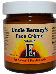
Vitamin E Face Crème - 4 oz

Benefits: Highly effective in reducing stretch marks. Moisturizes and soothes eczema, dry, itchy and dam-aged skin. Tones uneven skin, mini-mize the appearance of existing scars and wrinkles. Suitable for all skin types.