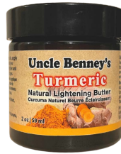
Turmeric Natural Lightening Butter - 2 oz

Benefits: Highly effective in reducing stretch marks. Moisturizes and soothes eczema, dry, itchy and dam-aged skin. Tones uneven skin, mini-mize the appearance of existing scars and wrinkles. Suitable for all skin types.