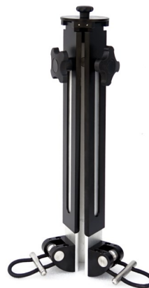
Aluminum Tripod Spreader