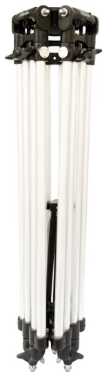
150mm Camera Tripod Stand

Please inspect the contents of your shipped package to ensure you have received everything that is listed below.