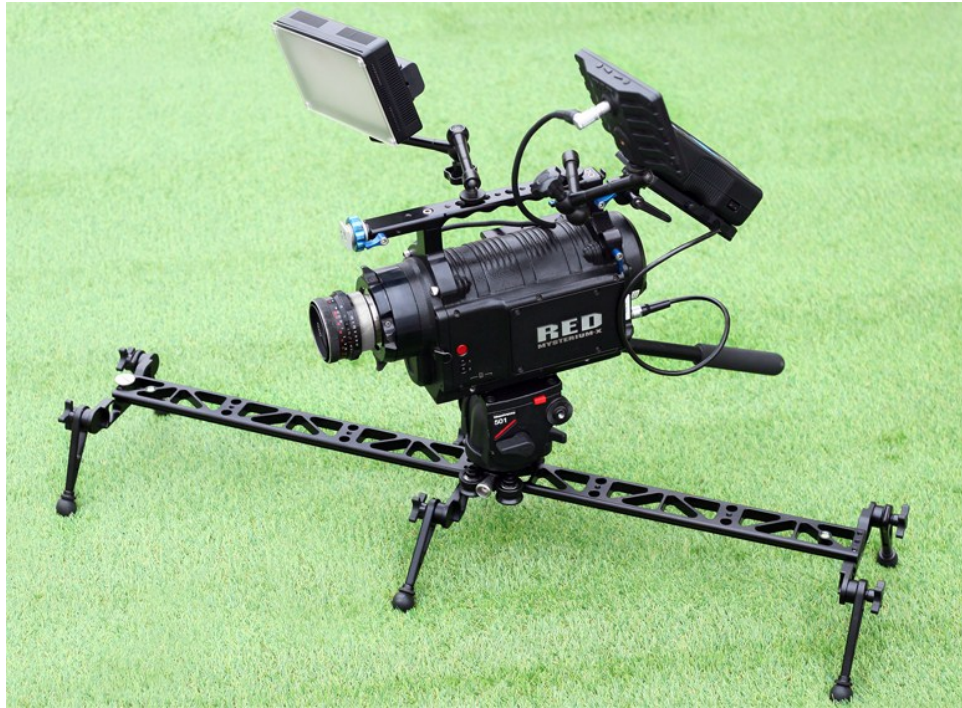
(SHOWN WITH OPTIONAL ACCESSORIES)

Warranty: We offer one year warranty for our products from date of purchase. Within this period of time, we will repair it without charge for labor or parts. Warranty doesn't cover transportation costs nor does it cover a product subjected to misuse or accidental damage. Warranty repairs are subjected to inspection and evaluation by us.