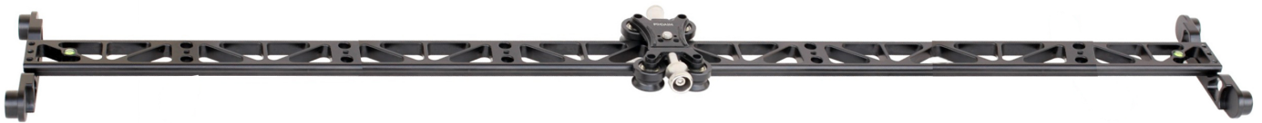
Proaim 4ft Line Slider

Please inspect the contents of your shipped package to ensure you have received all that is pictured and listed below.