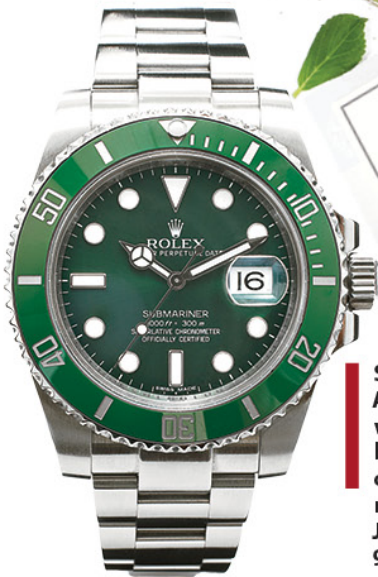
Stainless-steel Rolex 50th Anniversary Submariner, with green bezel and oyster bracelet, $11,200 (pre-owned price available upon request) at Daoud's Fine Jewelry, Fort Lauderdale, 954-928-2437, daouds.com .

Hautebox offers specially curated gift boxes and delivery service. We are especially fond of The Rugged Gentleman's Box for Father's Day, which includes Daneson Toothpicks, Mason Whisky Stone, Hudson Made Beard and Shave Soap, Hudson Made Beard Tonic, Izola Flask, Shoe Brush and a Pack of Matches, $200. Eight different boxes are available at shophautebox.com .