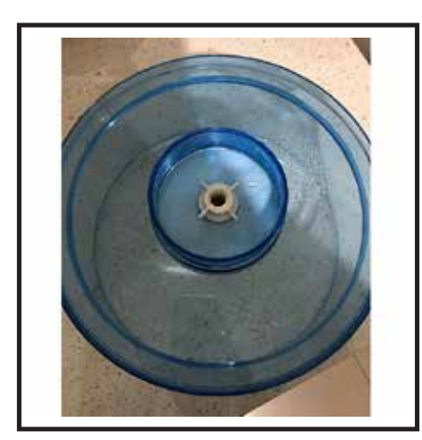
5. Unscrew the dome and take it out.