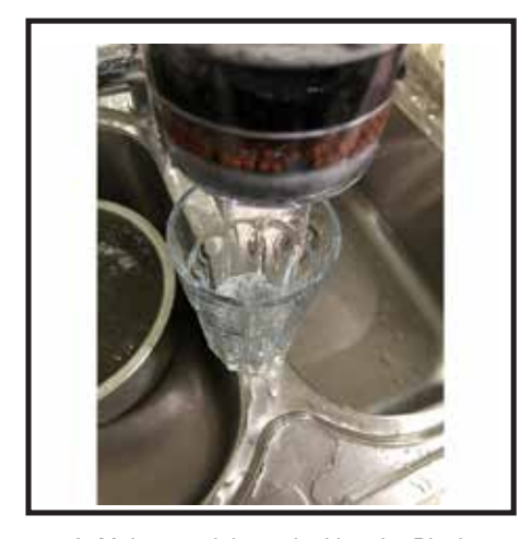
3. Make sure it is not leaking the Black Colour anymore.