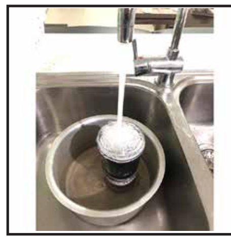
Wash the filter under running water for approximately 10 min or till it stop leaking black natural colour from the Activated Charcoal