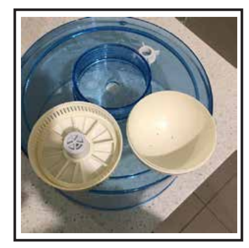
6. Now gently hold the lower part of the dome with one hand and the upper part with another hand. Spin anticlockwise with care and open it. Replace the pads with new one.