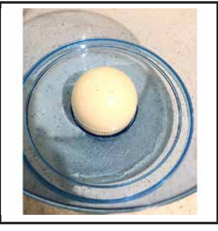
Take of the upper part of the tank - where dome has installed