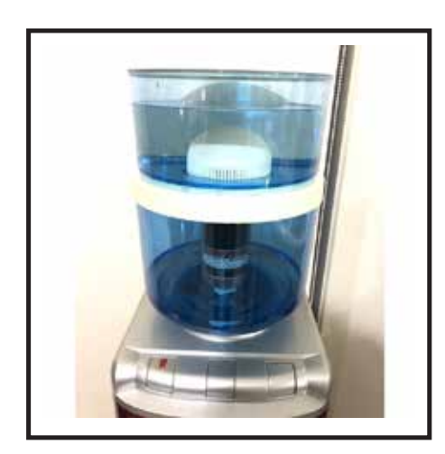
8. Finally, all ready to go! just pour the water as usual and enjoy the fresh water from the filter.