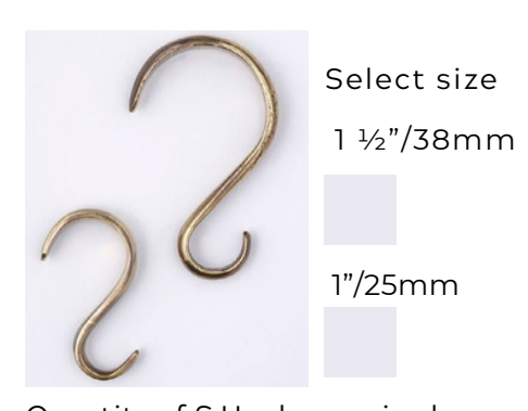
Quantity of S Hooks required:

The connector link will help transition the connection between the bracket and the chain.