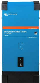
Phoenix Inverter Smart 12/2000