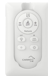
- Remote (Optional)