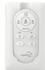
- Remote (Optional)