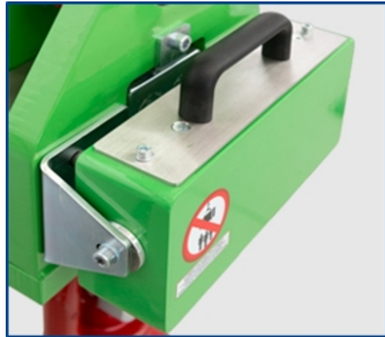
Fitted with extractable rechargeable battery pack.