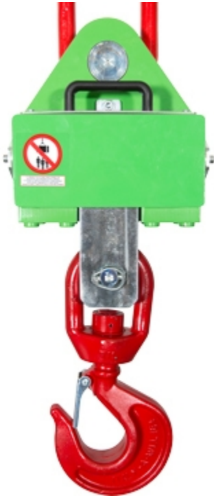
MCWHU: view of the back.