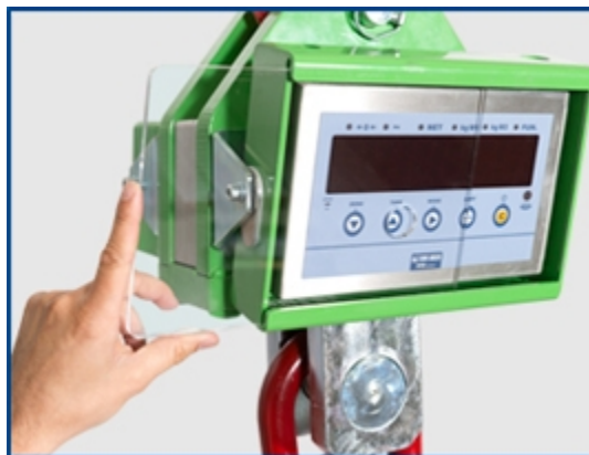
Protective screen in plexiglas for display and keyboard.