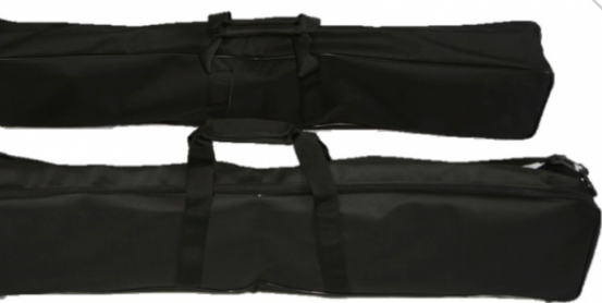
Optional carry case