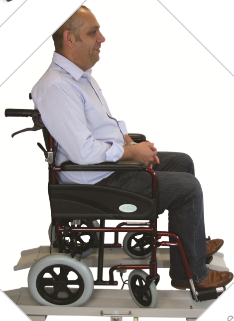
Accommodates large wheelchairs