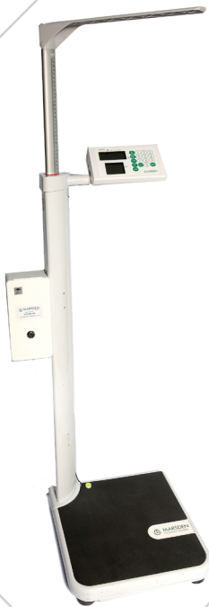
Optional coin box, ideal for Pharmacies