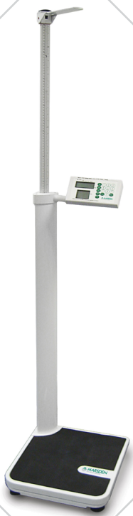
Uniquely designed corner column scale