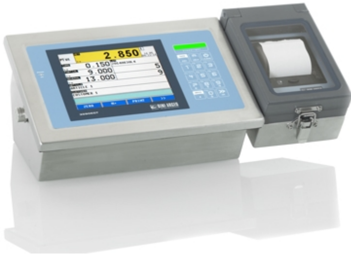
3590EGT with IP65 INOX printer