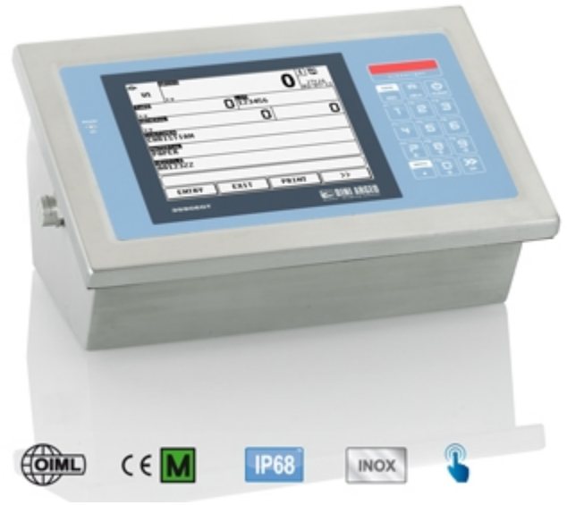
3590EGTXT01BC Stainless steel weight indicator with touch screen display.