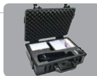
Includes Hard Case