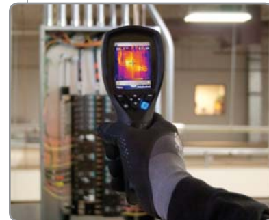
Find Hot Spots Fast!