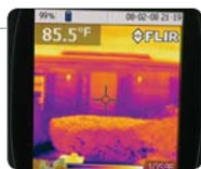
Excellent 2.8" Color LCD Shows the Whole Scene