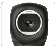
Focus-free Lens for Point-and-Shoot Simplicity