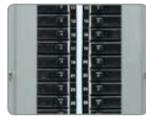
Human Eye View