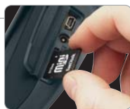
Removable SD Card and USB Output for Fast Image Downloads