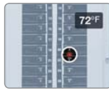
IR Thermometer Single Spot