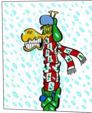
Page 1: colder