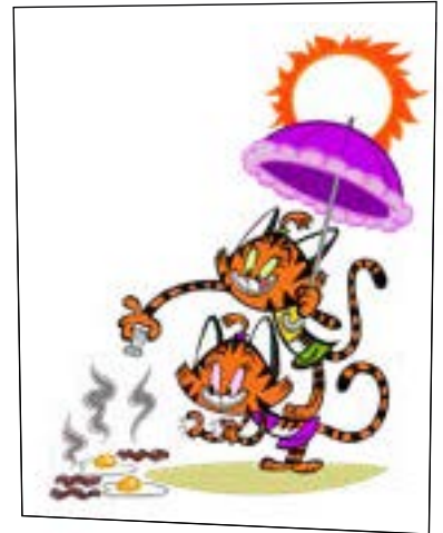
Page 2: warmer