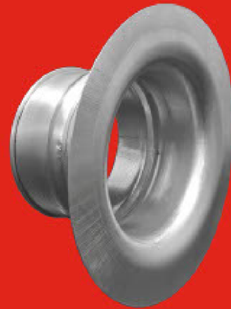
Bell Mouth W/ Rolled Lip