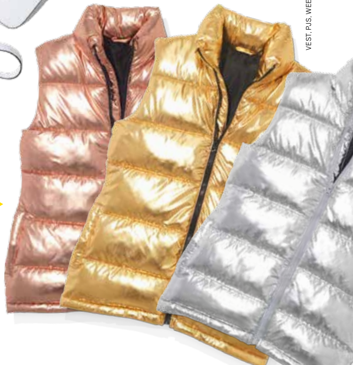
VEST, P.U.S. WEEKEND BAG; THOMAS LIGGETT; SHOULDER BAG; DEVON JARVIS/STUDIO D.

Make like a Bond girl in these machine-washable, quilted, insulated puffer vests in three very hot metallic shades. (Material Girl puffer vests in rose gold, gold, and silver, $60 each; macys.com)