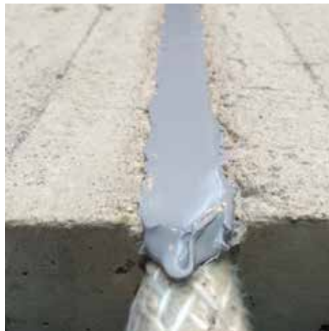
FJ203 bonded with FO142/3 Intutac + FS703 for waterproofing: EI240

Tremco CPG UK Limited reserves the right to alter product specifications without prior notice, in line with Company policy of continuous development and improvement.