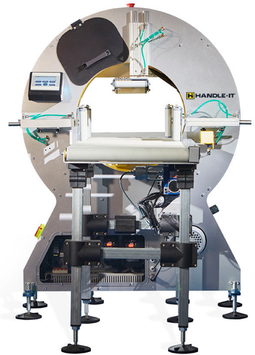
FA-50 with driven conveyors (optional) Top & lateral presses (optional)