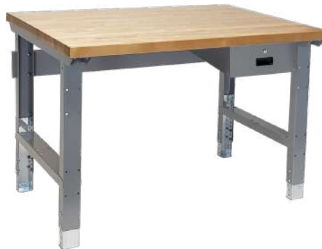
workbench with drawer