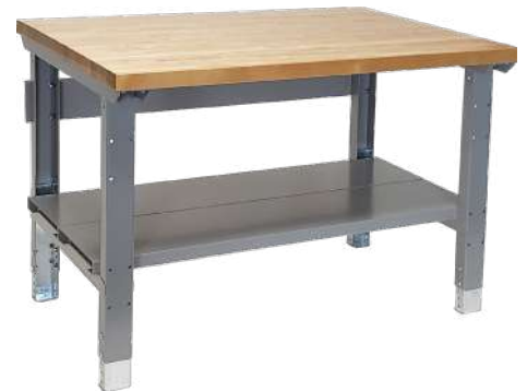
workbench with two shelves