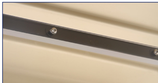
STEP 4E: Place remaining bolts attaching polycarbonate to bracket. Metal 10-L washer goes between bolt head and polycarbonate. Rubber washer is positioned between polycarbonate and bracket.