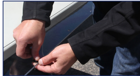
STEP 4C: Repeat step 4B at the trailing edge of the polycarbonate (4th hole from the front of the partition).