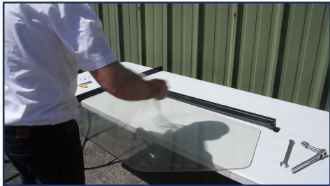
STEP 4A: Remove protective masking from polycarbonate.