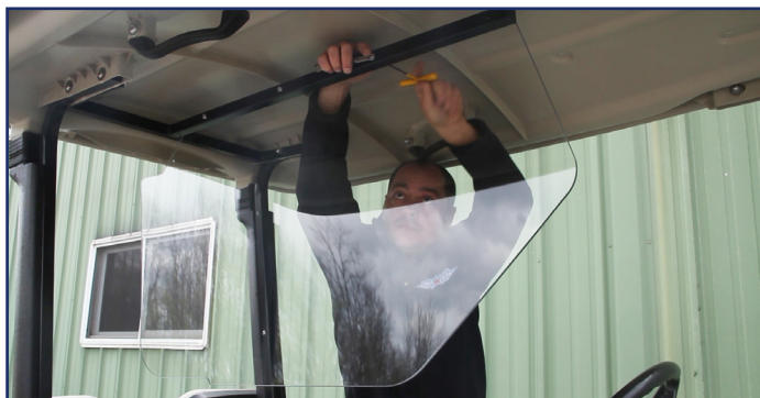
STEP 4F: Affix and tighten 10/32 Lock nuts using 1/8" allen wrench and 3/8" crescent wrench.