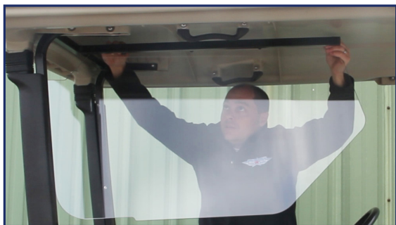
STEP 4D: Attach polycarbonate by placing bolts through holes on bracket.