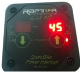
IN PROGRAM MODE FOR KILL SETTING MODE (KILL DISPLAY FLASHING)

WE RECOMMEND STARTING AT 50 mSec KILL TIME AND WORKING YOUR WAY DOWN UNTIL THE BIKE DOESN'T SHIFT, THEN MOVING THE KILL TIME BACK UP A FEW mSec. DURING INITIAL TESTING, WE HAD A GSXR1000 THAT WE WERE ABLE TO SHIFT AT 37 mSec IN FIRST GEAR WITHOUT NITROUS AND 43 mSec WITH THE SPRAY! HOWEVER, EVERY SETUP IS DIFFERENT AND YOU WILL HAVE TO FIND THE PERFECT SETUP THROUGH TESTING.