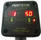
IN PROGRAM MODE SHOWING 1ST GEAR AND ITS KILL TIME SETTING (KILL TIME FLASHING)