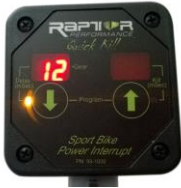
IN PROGRAM MODE FOR DELAY SETTING (DELAY TIME FLASHING)