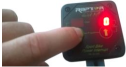
INITIATING NON GEAR SETUP MODE ("0" SCROLLS ACROSS DISPLAYS)