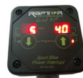
QUICK KILL IN PROGRAM MODE SHOWING EACH GEAR (2-5) AND ITS KILL TIME SETTING (KILL TIME FLASHING)