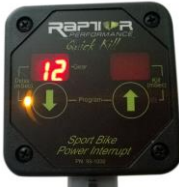
IN PROGRAM MODE FOR DELAY SETTING (DELAY TIME FLASHING)