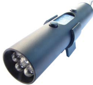
Dual Mode Launch/Shift Light Operating Instructions (Gen II) Firmware Rev: V1.8

1 YEAR LIMITED WARRANTY ON MANUFACTURE DEFECTS. IN NO EVENT WILL RAPTOR PERFORMANCE OR ANY OF ITS AFFILIATES BE RESPONSIBLE FOR DAMAGES OF ANY NATURE WHATSOEVER RESULTING FROM THIS PRODUCT. NO OTHER CLAIMS ARE MADE ABOUT THIS PRODUCT, EXPLICIT OR IMPLIED.