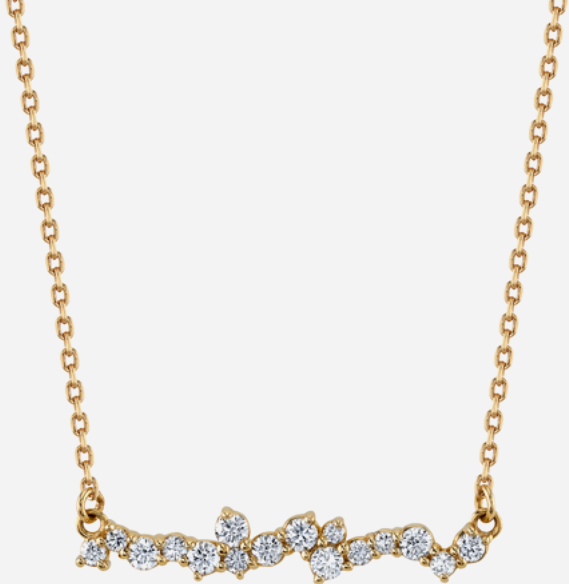
Scattered Diamond Necklace