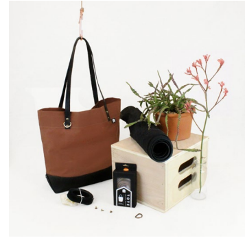
LEATHER + HARDWARE KIT