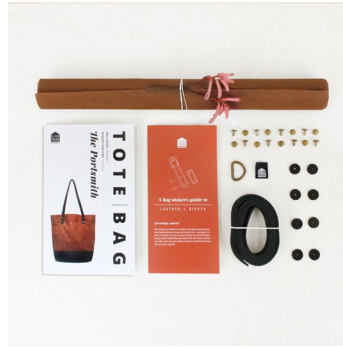
FULL MAKER KIT

contain everything but the fabric, for makers who prefer to source their own.