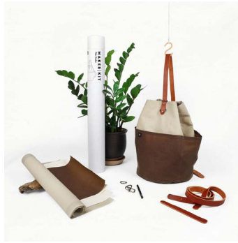
FULL MAKER KIT

contain everything but the fabric, for makers who prefer to source their own.