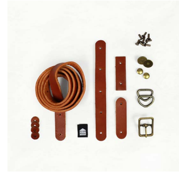
LEATHER + HARDWARE KIT