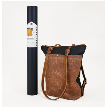
FULL MAKER KIT

contain everything but the fabric, for makers who prefer to source their own.