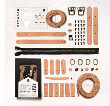
LEATHER + HARDWARE KIT