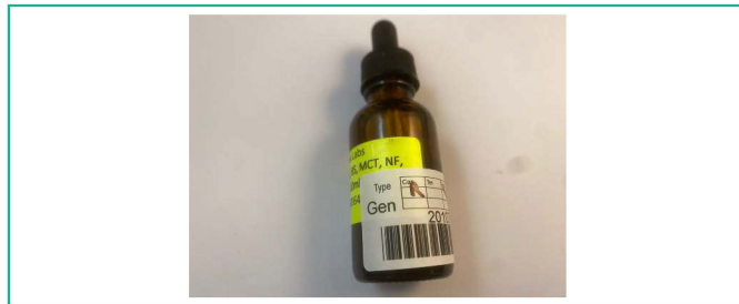
The photo on this report is of a sample collected by the lab and may vary from the final packaging

Ingestible, Tincture, Other Harvest Process Lot: ; METRC Batch: ; METRC Sample: