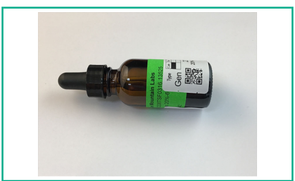
The photo on this report is of a sample collected by the lab and may vary from the final packaging

Test performed via Hardy chromogenic dry and agar plates. ND = Non Detect; LOQ = Limit of Quantitation; Tested Microbial Endpoints: Total Viable Aerobic Bacteria, Total Yeast and Mold, Total Coliforms, Enterobacteriaceae, Aspergillus (flavus, fumigatus, niger and terreus), E.coli pathogenic strains, and Salmonella spp. Microbial testing performed per SOP-000004 Method. LOQ has been set to the Limit of Detection (LOD) / Method Detection Limit (MDL) for all endpoints.